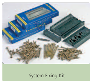
System Fixing Kit

The systems are supplied as a kit of parts including the 44 x 95mm and 33 x 120mm Multi-purpose material, the new 27 x 95mm Flat Chamfered Spindle and the new timber to timber connecting kit. The Grand Post material must be used to create the newel posts for the system. These can be ordered separately. Specific installation instructions are included in the kit of parts.