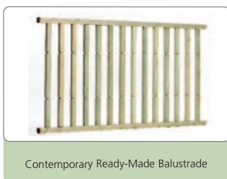
Contemporary Ready-Made Balustrade