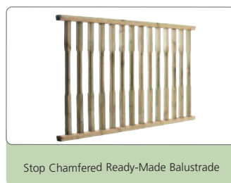
Stop Chamfered Ready-Made Balustrade