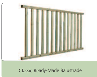
Classic Ready-Made Balustrade