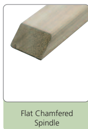
Flat Chamfered Spindle