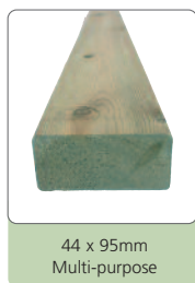
44 x 95mm Multi-purpose