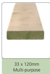
33 x 120mm Multi-purpose