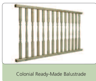
Colonial Ready-Made Balustrade