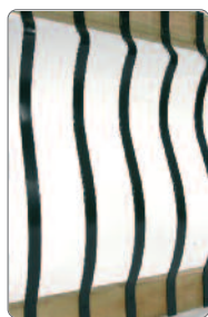
Baroque Baluster Black